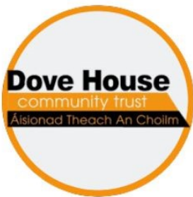
Dove House Community Trust Tel : (028) 7126 9327